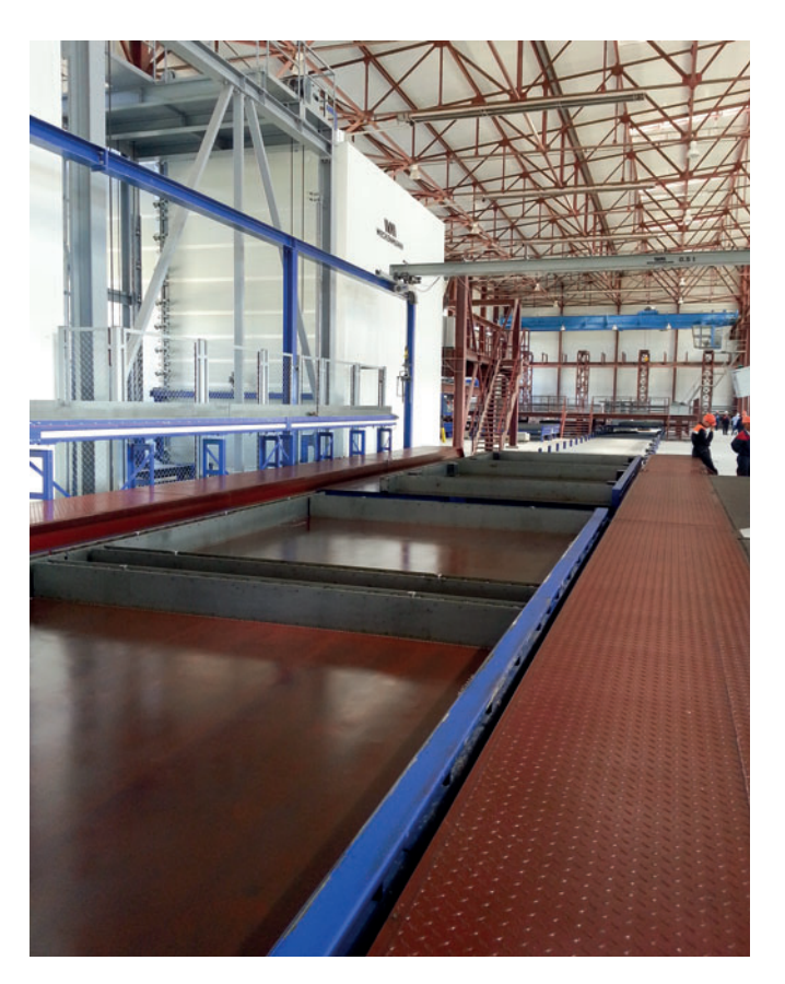
The new circulation plant that Weckenmann has erected in Kazakhstan is generously dimensioned for precast concrete elements.