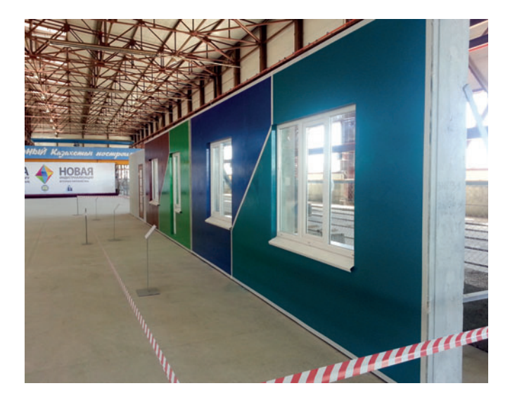
Ready for assembly on the building site: precast concrete side walls with already installed windows.

of a residential project can be reduced from twelve to six months with precast concrete elements from the new Weckenmann plant.