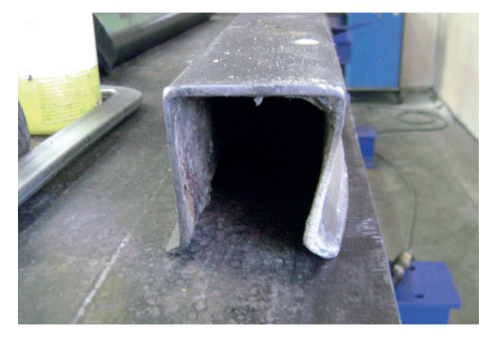
Before renovation of the stopend formwork systems: Deformed and dented stopend formwork