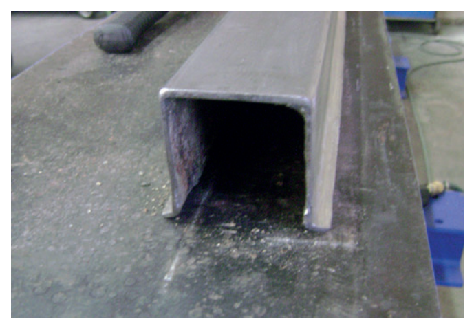
Afterwards: Stopend formwork as good as new: Straightened stopend formwork with optimised function