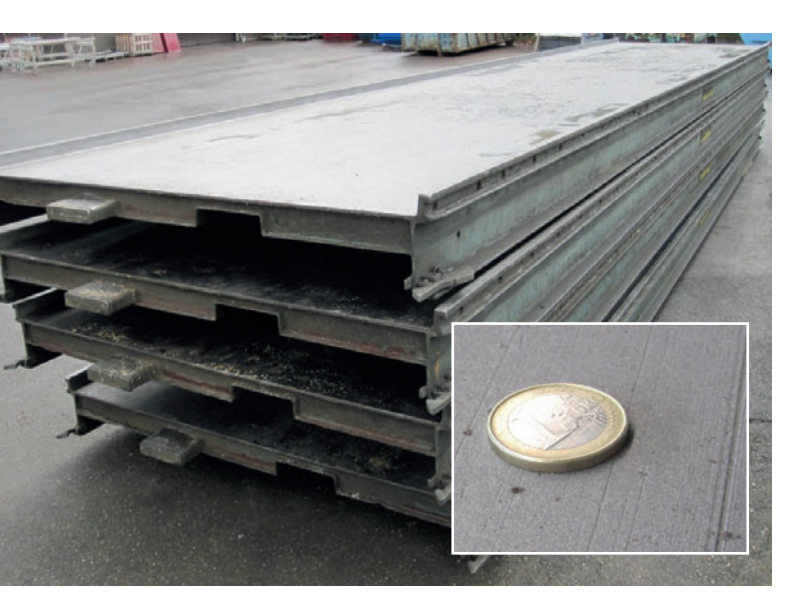
Poor quality of a pallet formwork surface before renovation: deep scoring and uneven formwork surface; poor paintwork

In 2007 a new production hall with a floor area of 3,000 sq. metres and state-of-the-art equipment for formwork construction was built for the manufacture of pallets, formwork and formwork systems. The most diverse moulds and formwork systems are manufactured there in very high quality by a well-rehearsed and experienced team. Whether pallets or form-work systems with magnet technology for circulation plants, stationary formwork such as tilting tables, battery moulds or moulds for rod-shaped concrete elements - there is a product to suit every customer requirement.