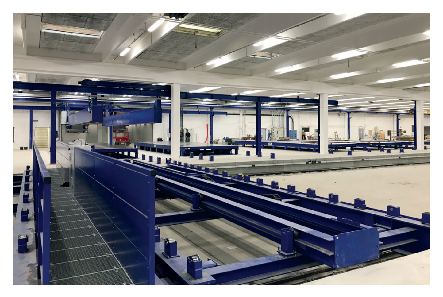
Central transfer table with double platform

As a further advantage the transfer table has two platforms and can therefore transport two pallets at the same time. This has a positive effect on the utilisation planning and the fast conveying of the pallets. A concrete distributor with two buck-