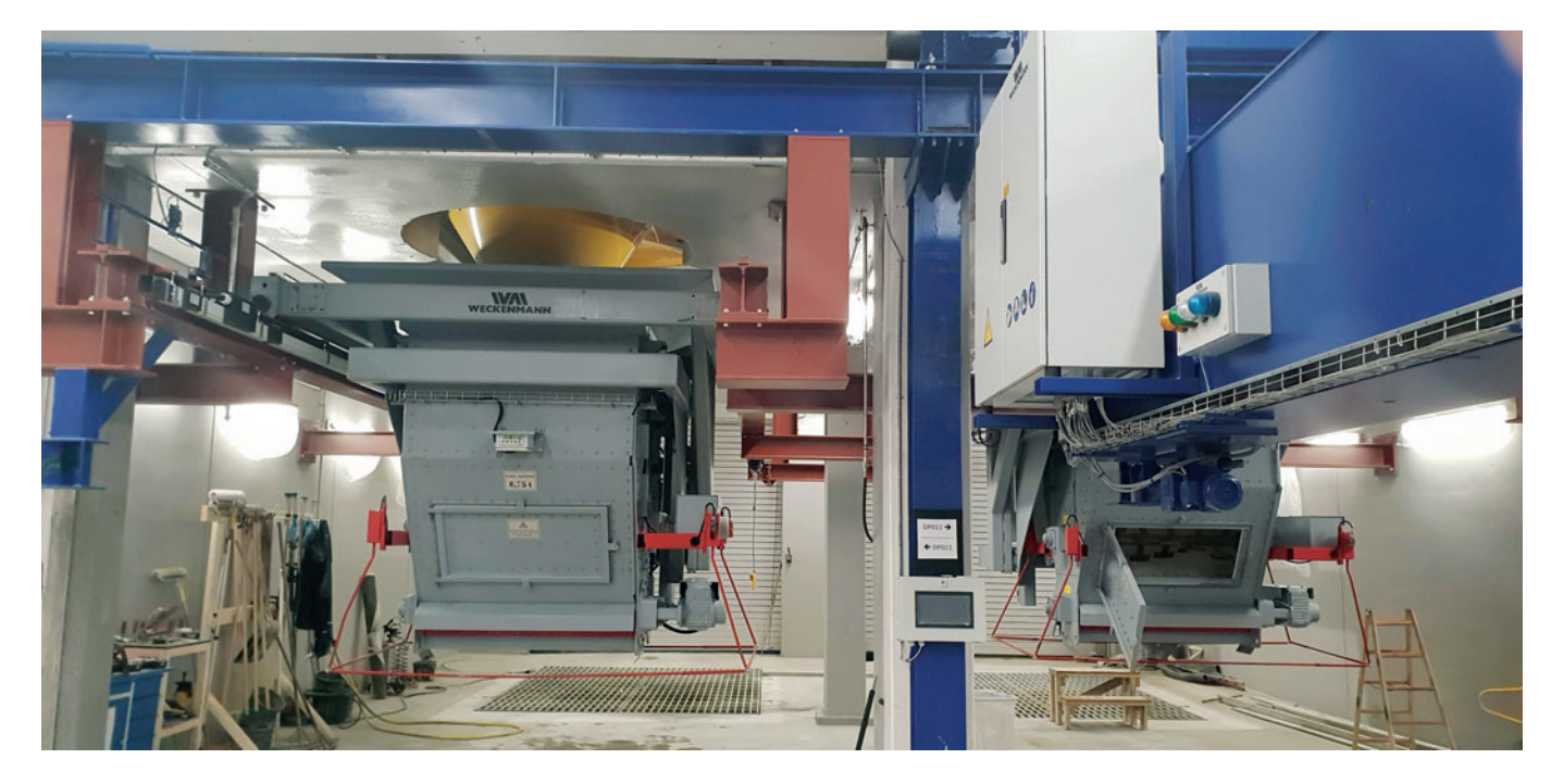
Concrete distributor with two buckets

Weckenmann Anlagentechnik GmbH+Co.KG Birkenstraße 1 72358 Dormettingen, Germany T +49 7427 94930 F +49 7427 949329 info@weckenmann.de www.weckenmann.com